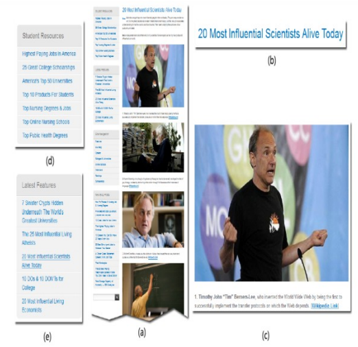
Fig.1. Snapshot of a typical top-k page and its page segments