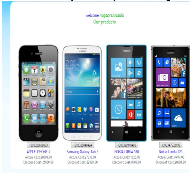
Fig. 2. All Products.

Following are the results of Sentimental Analysis and Opinion Mining.