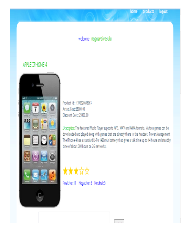
Fig. 3. User Product Rating

When user login into the portal, then he will get this screen. He will select the product which he wants to comment. When he selects the product then he will get details of individual products.