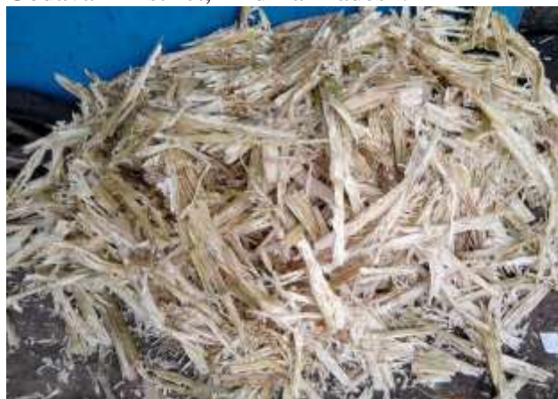
Fig.1 Sugarcane Bagasse

The sugarcane bagasse ash consists of approximately 50% of cellulose, 25% of hemicelluloses and 25% of lignin. Each ton of sugarcane generates approximately 26% of bagasse (at a moisture content of 50%) and 0.62% of residual ash. The residue after combustion presents a chemical composition dominated by silicon dioxide (SiO 2 ). In spite of being a material of hard degradation and that presents few nutrients, the ash is used on the farms as a fertilizer in sugarcane harvests. In this sugarcane bagasse ash was collected during the operation of boiler operating in the Nava Bharat Ventures Sugar Factory, located in the Samalkot, East Godavari District, Andhra Pradesh.