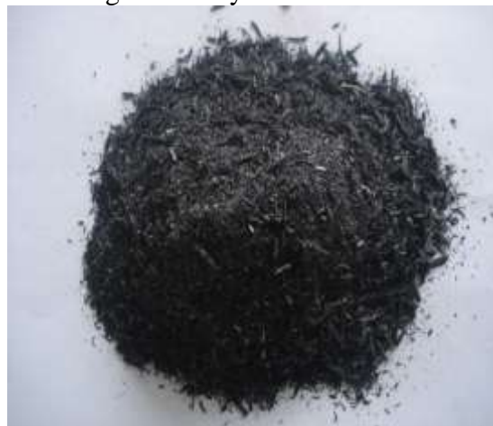
Fig.2 Bagasse Ash

These values are taken from the Nava Bharat sugar industry located at samalkot