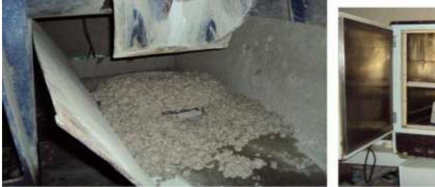
Figure 2: Mixing of ingredients