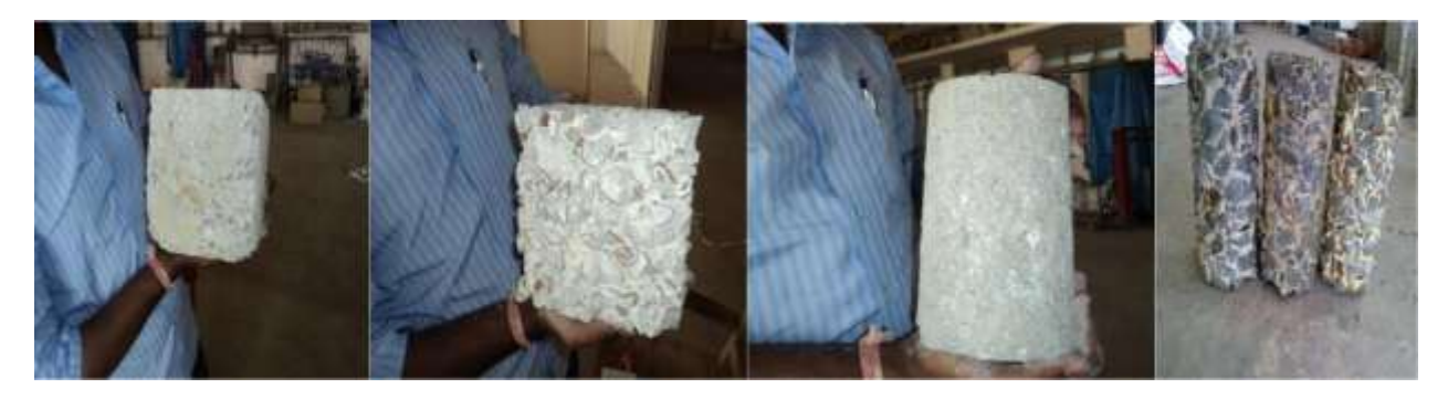
Figure 4: GPC and PPCC specimens exposed to Sulphuric acid solution after 45 days

AIJREAS VOLUME 1, ISSUE 11 (2016, NOV) (ISSN-2455-6300) ONLINE ANVESHANA'S INTERNATIONAL JOURNAL OF RESEARCH IN ENGINEERING AND APPLIED SCIENCES