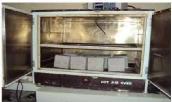
Figure 3: Curing of specim