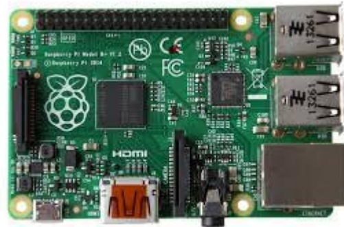
Fig 1: Raspberry Pi

continual garage .T he basis provide Debian and Arch Linux ARM distribution for down load. tools are available for Python as the main programming language, with assist for BBC simple (through the RISC OS picture or the Brandy primary clone for Linux ),C,C++,Java, Perl and Ruby.