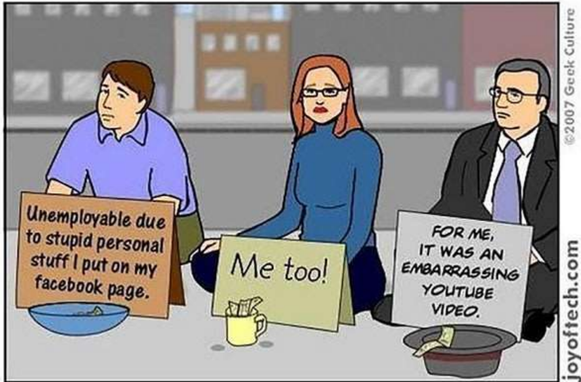
Signs of the social networking times.

Unfortunately, by the time private content is deleted, it's usually too late and can cause problems in people's personal and professional lives.