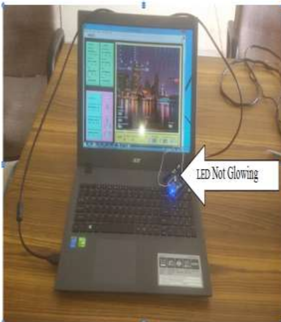
Fig. 7 Over Voltage Fault (LED Load) OFF

The fig.7 depicts over voltage fault condition in which the LED (load) is not glowing and thus the system is protected against fault.