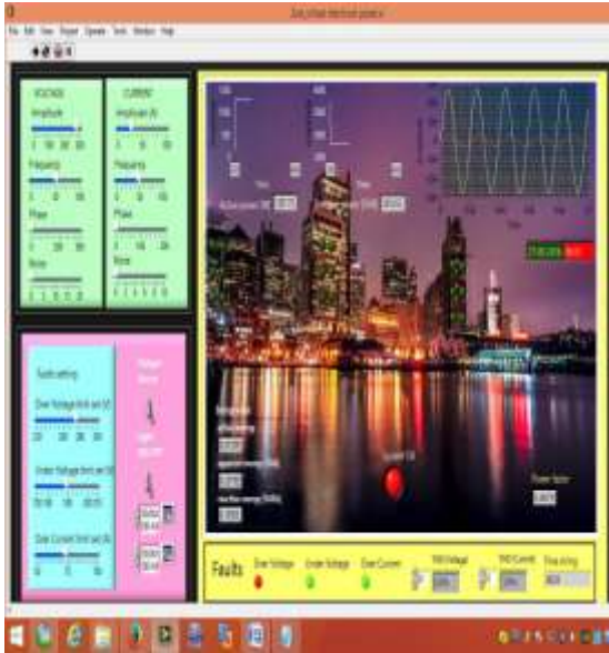
Fig. 6 Over Voltage Fault

The fig.7 depicts over voltage fault condition in which the LED (load) is not glowing and thus the system is protected against fault.