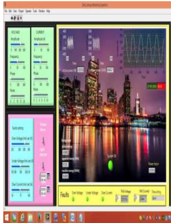
Fig.4 No Fault Condition

lights of all three faults are glowing green in no fault condition.