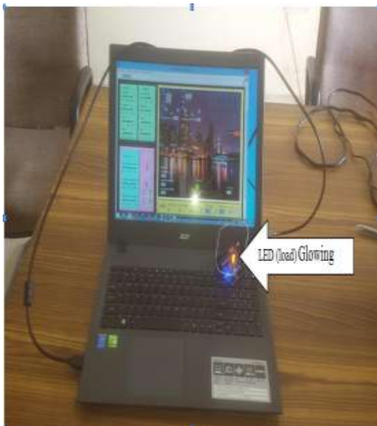
Fig. 3 Validation Using ARDUINO

In fig.2, graphic user interface of software developed is shown. In fig.3, the interfacing of LabVIEW and Arduino is shown.