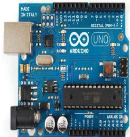
Fig.1 Arduino UNO Chip

Arduino is an open-source platform used for building electronics projects. Arduino consists of both a physical programmable circuit board (often referred to as a microcontroller) and a piece of software, or IDE (Integrated Development Environment) that runs on your computer, used to write and upload computer code to the physical board. In fig. 1, Arduino UNO is shown.