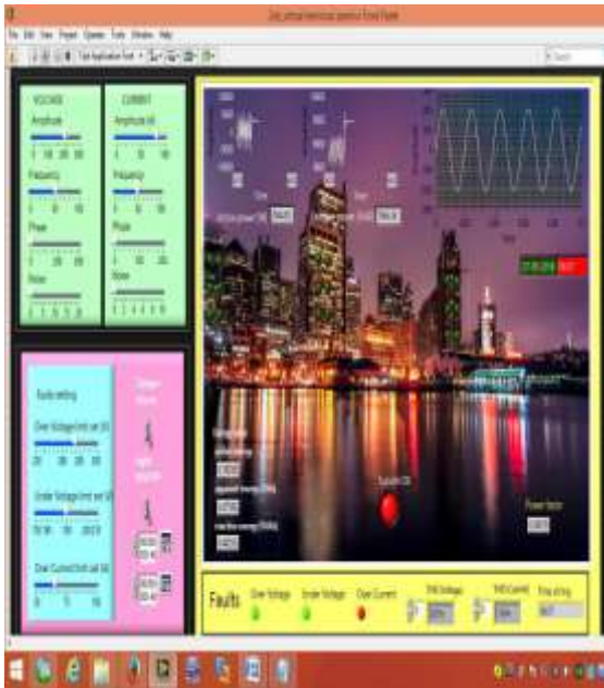
Fig. 9 Over Current Protection