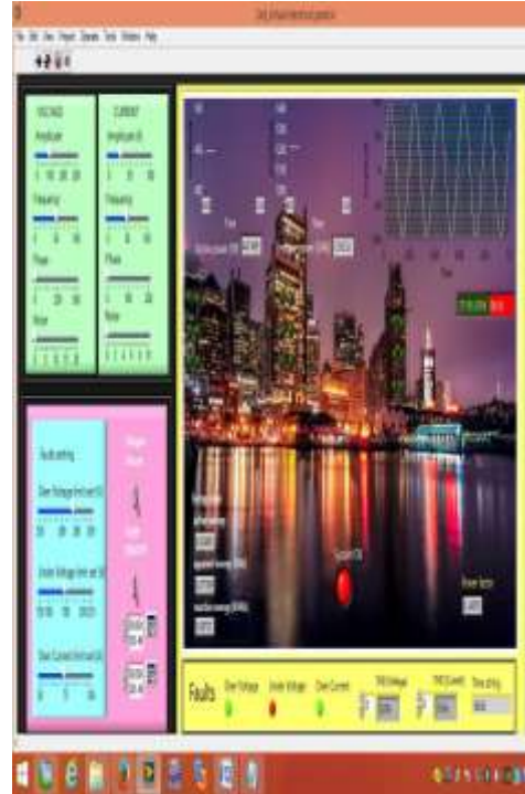
Fig. 8 Under Voltage Fault

In fig. 9, short circuit protection is shown which is running successfully. In over current fault, the system OK light goes red.