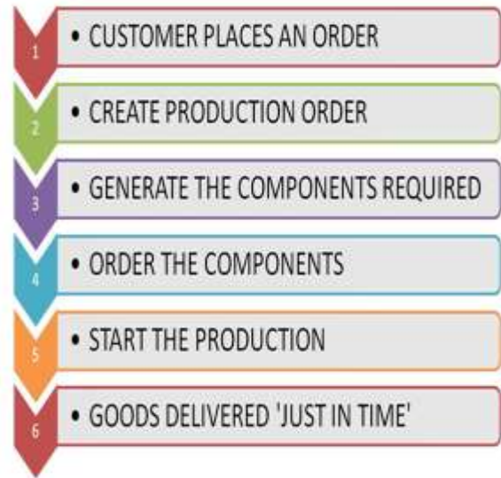
Fig.2 JIT 'Pull' type system-example

JIT implements Pull type system, the process can be shown as