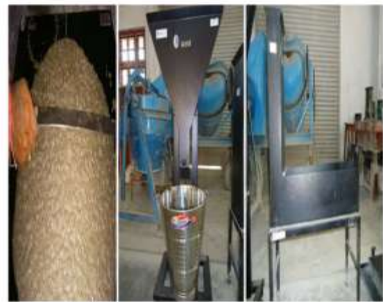
Figure-2: (A) Slump flow test, (B) V-Funnel test, (C) L-Box test

To determine the fresh properties of SCC, different methods were developed. Slump flow and V-Funnel tests have been proposed for testing the deformability and viscosity respectively. L-Box test have been proposed for determining the segregation resistance.