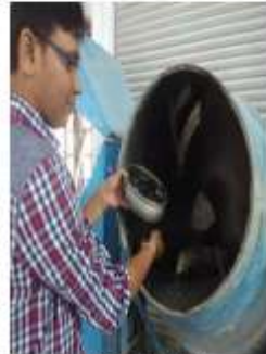
Figure-2: Preparation of SCC Mix