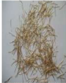
Figure-1: Photograph of Chopped Steel Fiber