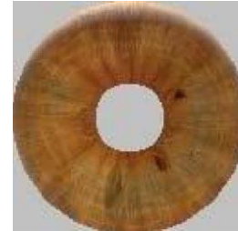
Fig.II.1 BMP picture as Cover-picture