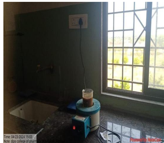
Fig No . 7.2 :- Decoction of Herbal Drug