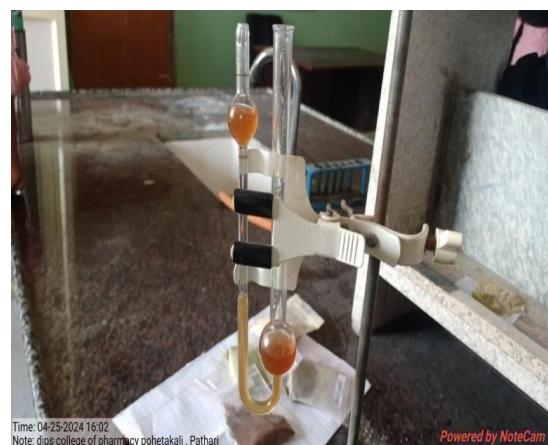
Fig 7.5 :- Viscosity Examination

Density of water x Time required to flow water.