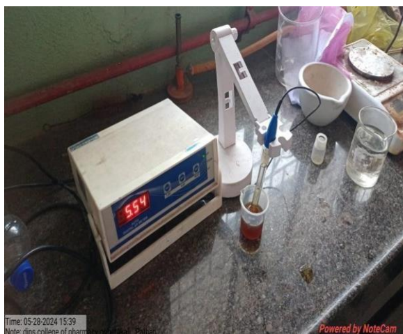
Fig 7.4 :- pH Examination